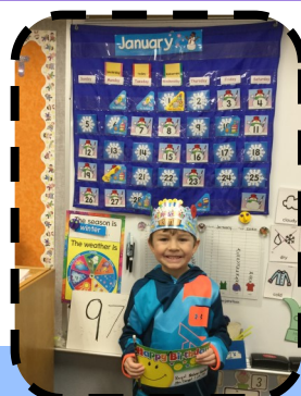
Happy 6th Birthday to Royal on January 28th! !